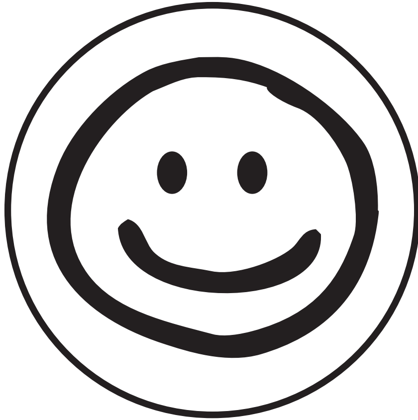
Dwell Year 2, Unit 4, Session 1