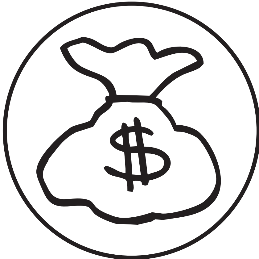
Dwell Year 2, Unit 4, Session 2