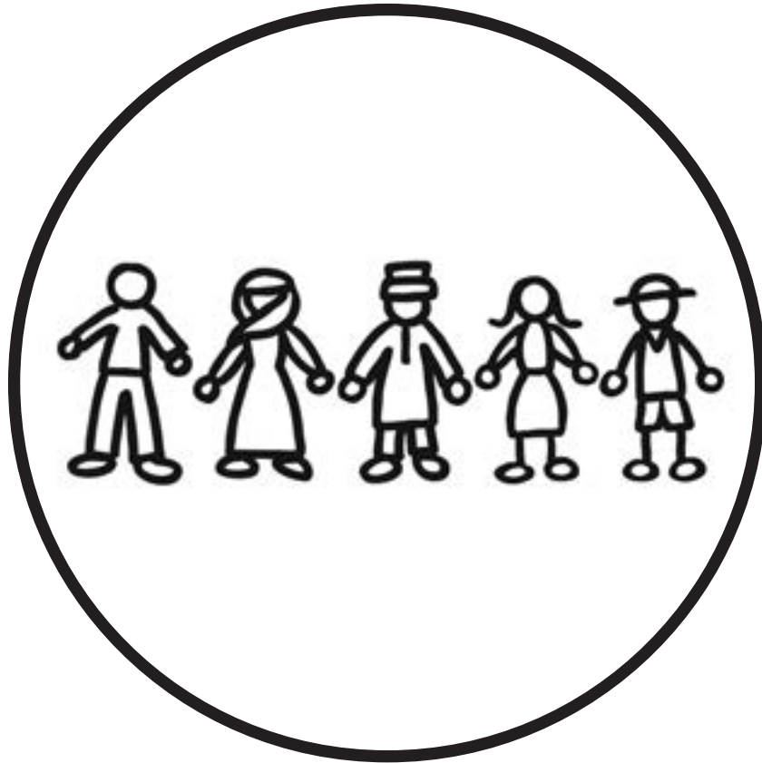
Dive Year 2, Unit 4, Session 5