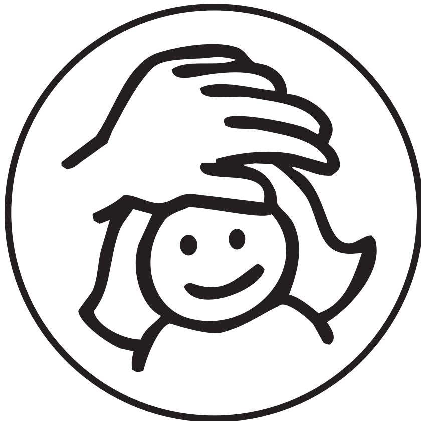
Dive Year 2, Unit 4, Session 6