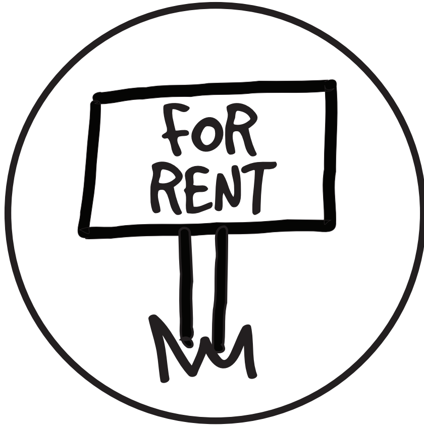
Dwell Year 2, Unit 4, Session 3