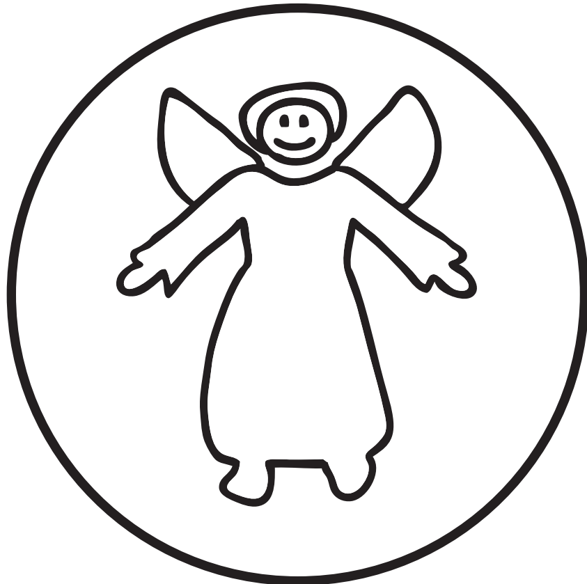
Year 1, Unit 1, Session 2