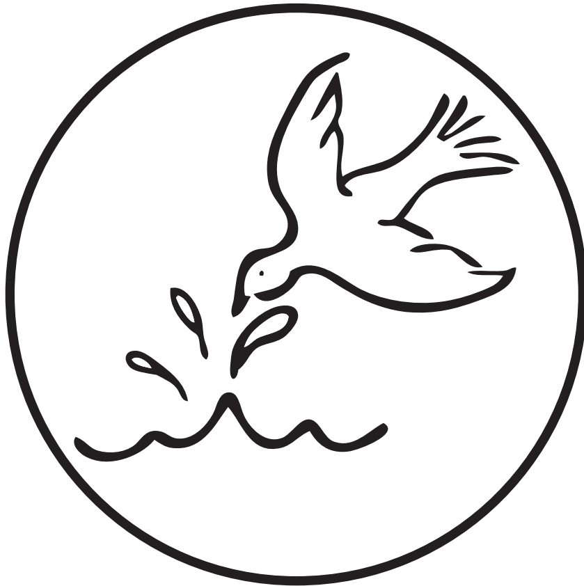
Year 1, Unit 1, Session 6