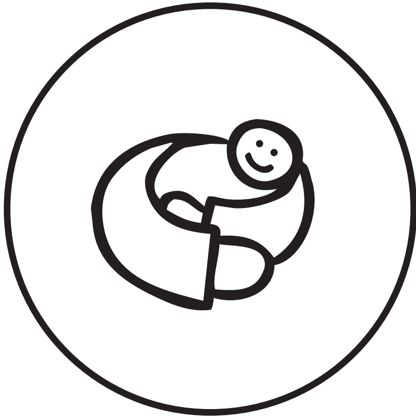
Year 1, Unit 1, Session 4