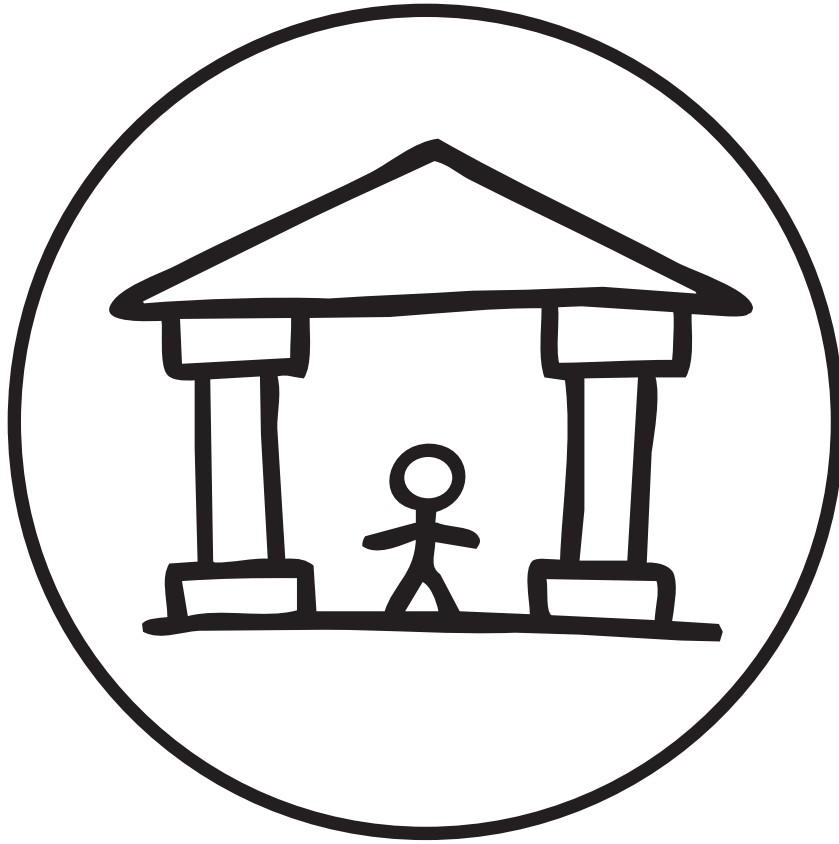
Year 1, Unit 1, Session 5