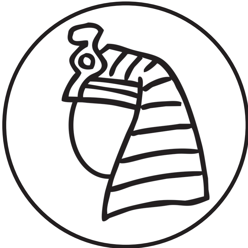
Year 2, Unit 2, Session 6