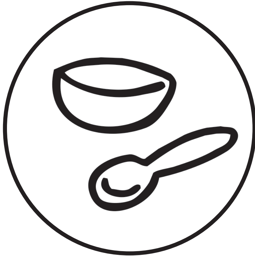
Year 2, Unit 2, Session 3