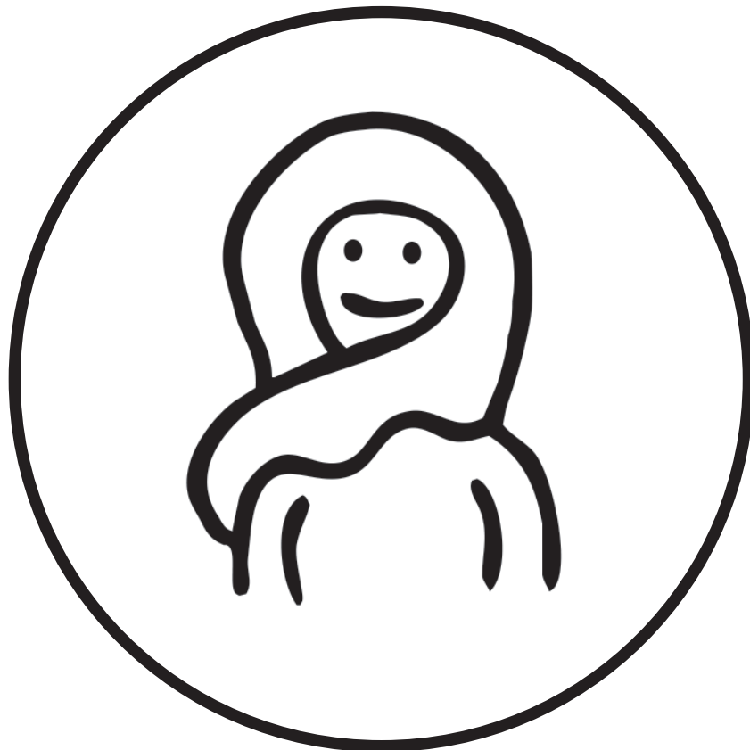
Year 2, Unit 2, Session 4