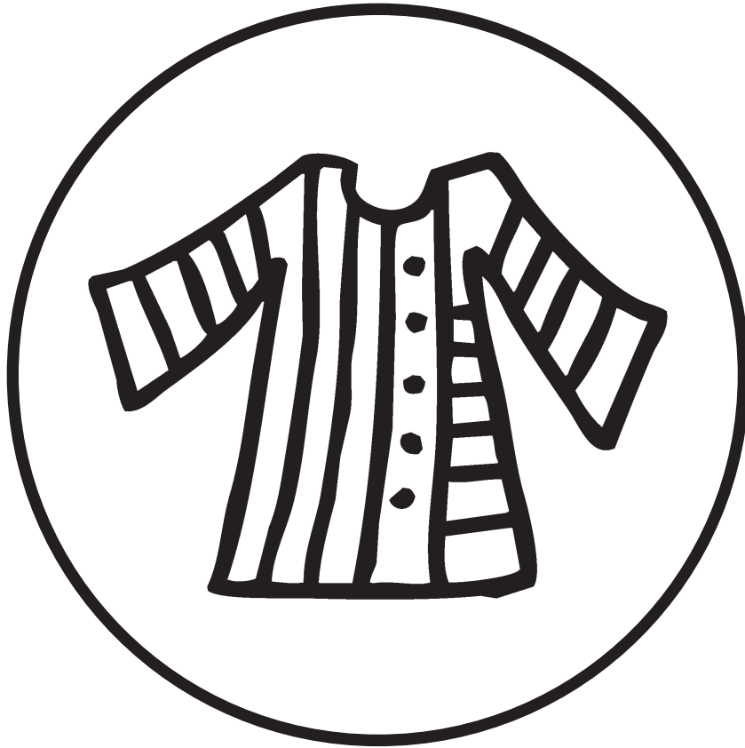
Year 2, Unit 2, Session 5