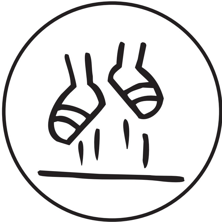
Year 1, Unit 5, Session 6