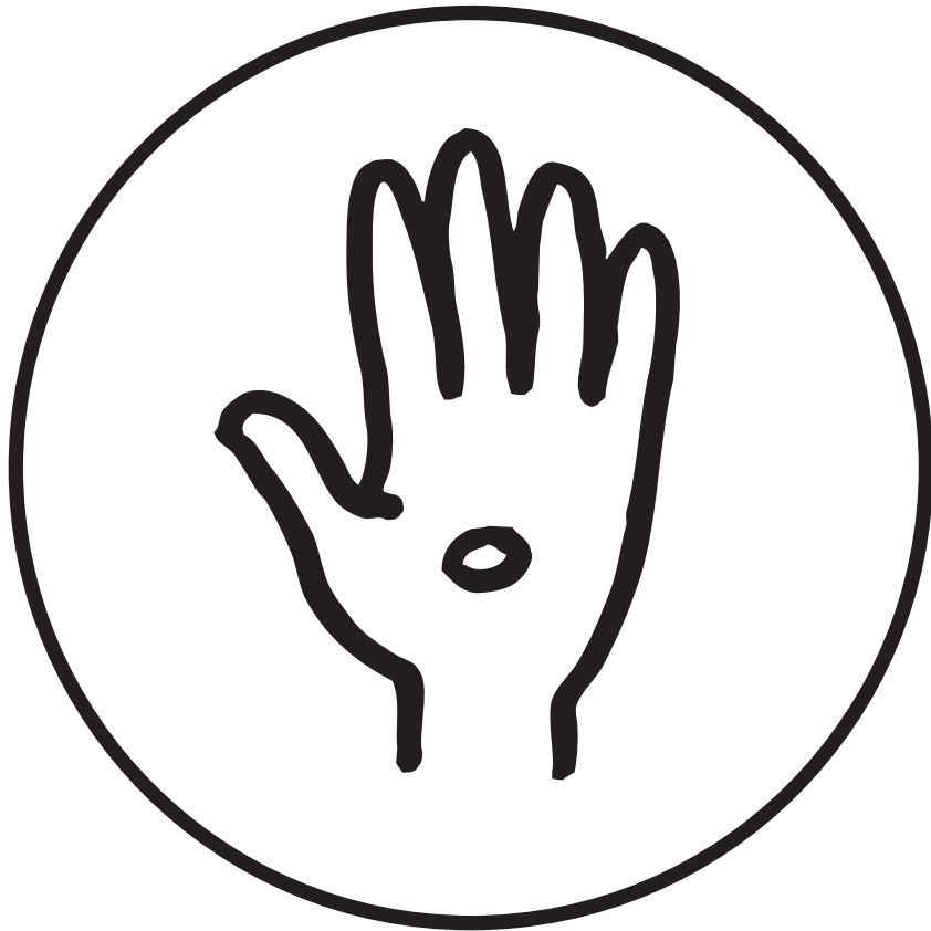
Year 1, Unit 5, Session 2