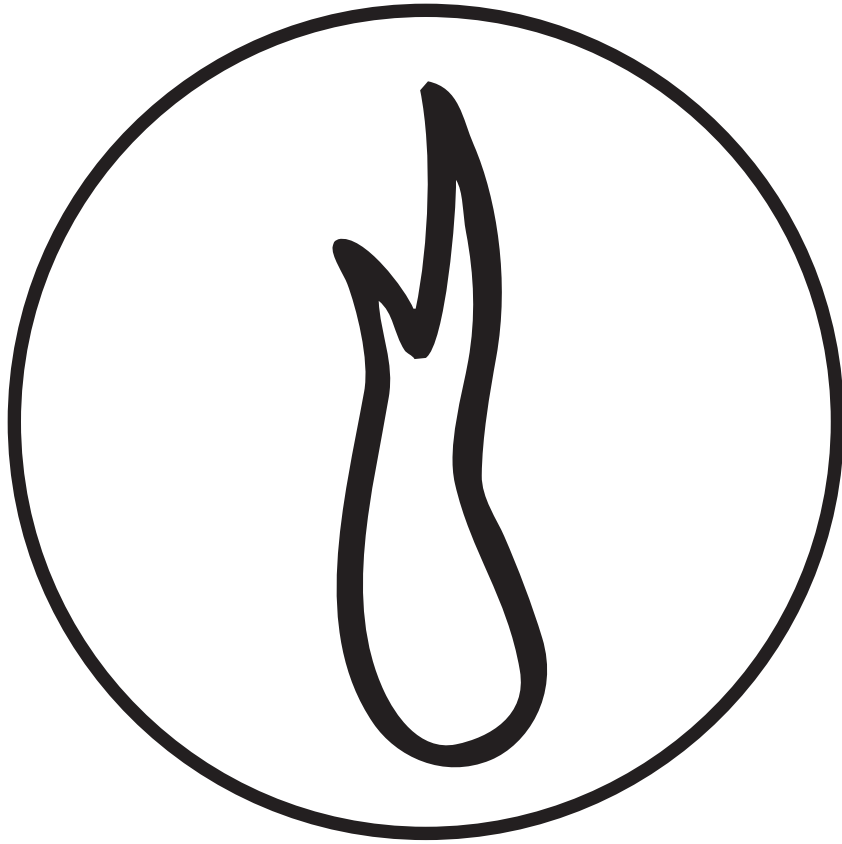
Year 1, Unit 5, Session 5