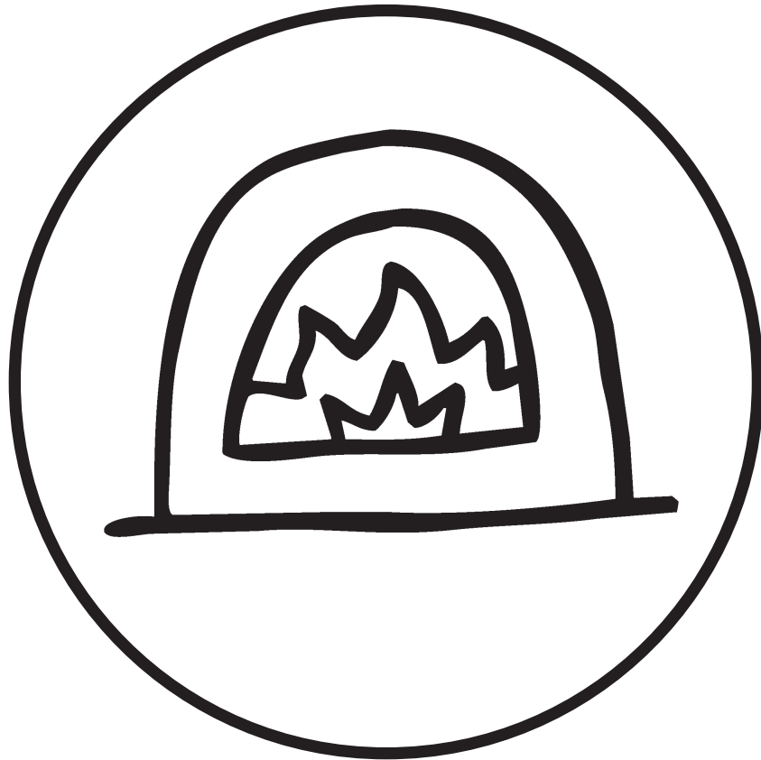
Year 2, Unit 6, Session 4