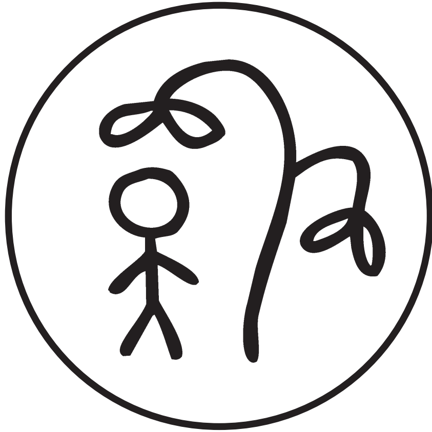
Year 2, Unit 6, Session 3