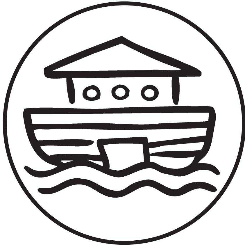
Year 4, Unit 1, Session 3