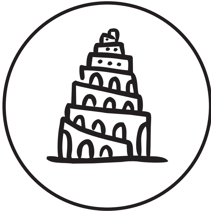
Year 4, Unit 1, Session 5